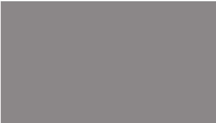
FULL SCREEN AD 16:9 RATIO (1920 pixels width x 1080 pixels height)